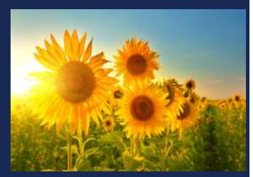
Summer Newsletter 2024 Click here