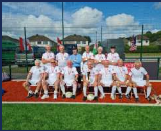
Ascend's Footballing 'Boy Wonder' Wins the Veterans World Cup! Click here